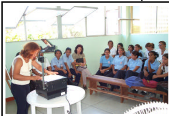
A reproductive health seminar for adolescents at the Ambulatorio Fe y Alegria in Cumaná.

Under the current government, public access to contraceptives has increased, although the services still do not meet the demand. This has allowed us to emphasize reproductive health education, directed primarily at the huge adolescent population (almost 50% of Venezuelans are under 21 years of age). In 2002, we reached over