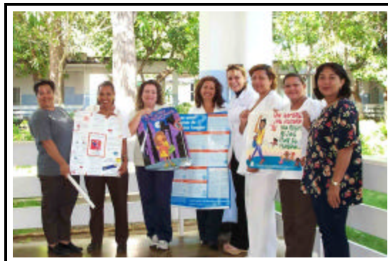
Staff at the public Hospital Julio Rodríguez, where the Foundation opened a family planning clinic in 2002.